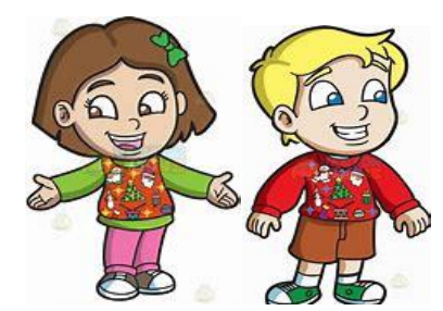
SAVE THE CHILDERN CHRISTMAS JUMPER DAY 13 DECEMBER

Parents are invited to the Year 1 Nativity in the KS1 Hall at 2pm on 12 December