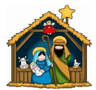
YEAR 1 NATIVITY 12 DECEMBER

13 DECEMBER Parents are invited to the Nursery Christmas Singalong in the KS1 Hall at 11am on 13 December.