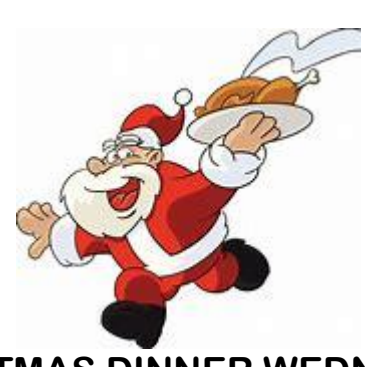
CHRISTMAS DINNER WEDNESDAY 18 DECEMBER

Don't forget to return your Christmas Lunch requests