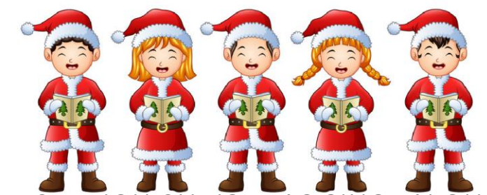
RECEPTION CHRISTMAS SING- ALONG 13 DECEMBER

You ONLY need to return the request slip if your child(ren) would like to participate.