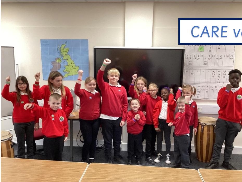
CARE value winners